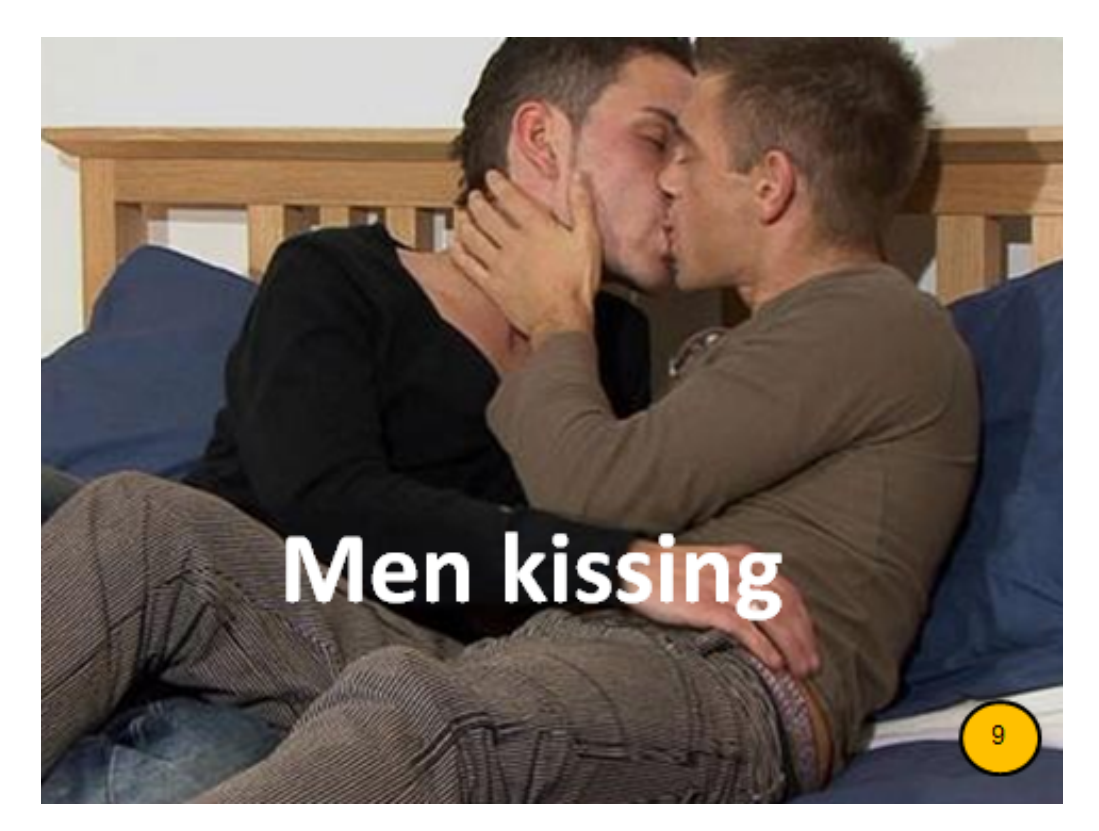
Figure 1: Explicit photographs and text cards

have had a harder time relating to them.